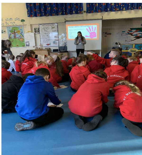
Pupils at St Margarets Primary School in Stoke Golding taking part in a Diversity workshop

Working in more than 17 primary and secondary schools already, there are many more schools booked in for the next term and staff are hopeful of exceeding targets set in previous years.