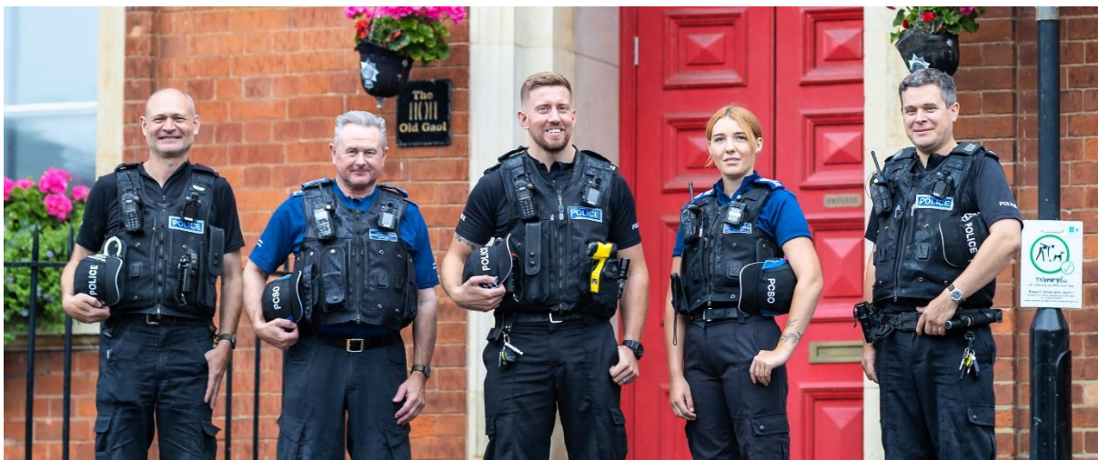
The NH 29 Beat Team