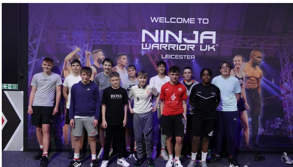
The winning Hinckley Kicks Team at Ninja Warrior in Leicester