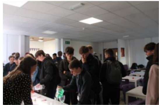
Demonstrations and activities for sixth formers at Brookvale Groby Learning Campus

A range of assemblies and talks have been delivered to secondary schools on healthy relationships & substance misuse and anti-social behaviour.