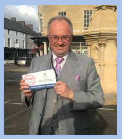
My "Safer streets" campaign, Uppingham