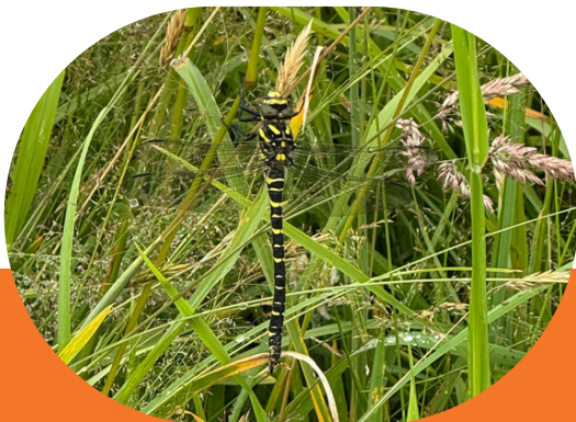
Golden ringed dragonfly

Please remember that the trees will grow again; coppicing is a traditional woodland management technique that dates back to the Stone Age!