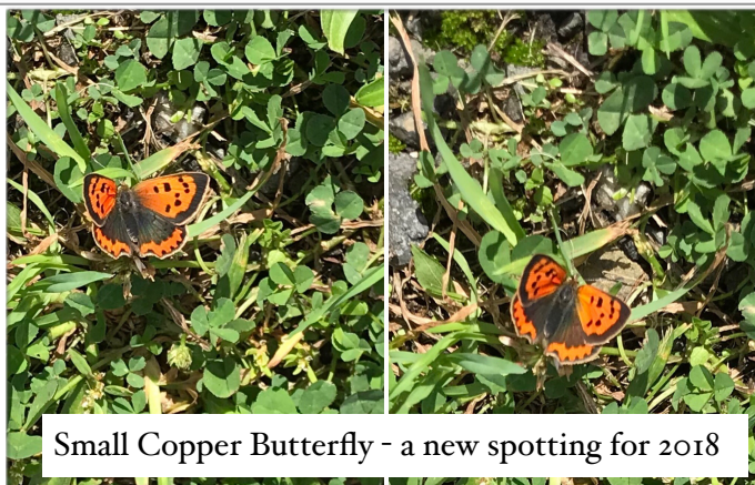
Small Copper Butterfly - a new spotting for 2018