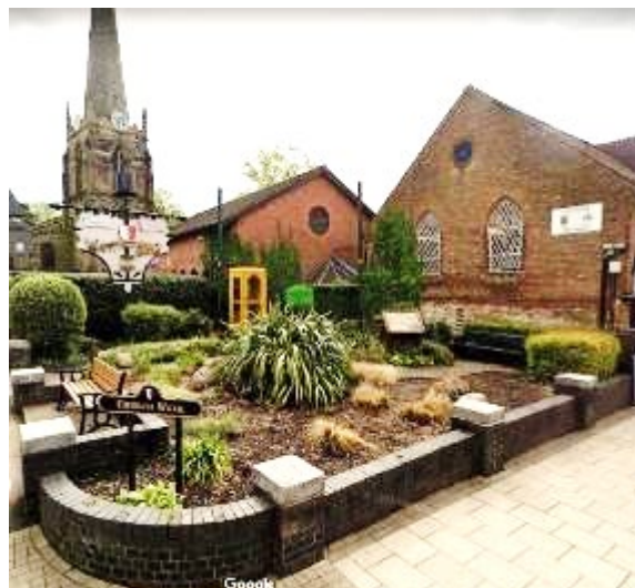
Herford Garden (Google Maps)