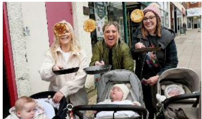
Hinckley BID Pancake Race – March 2022