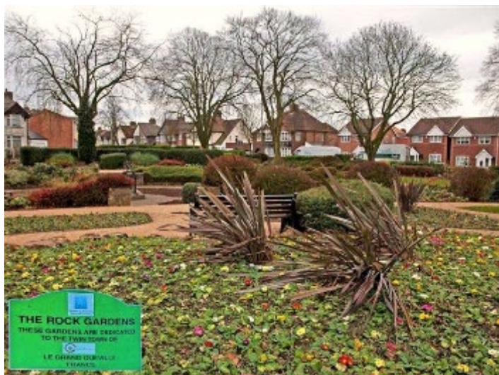
The Rock Gardens

Our twin town in France (Viewed 206 times in the past year)